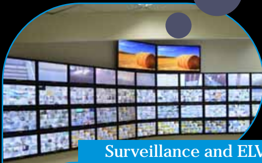
Surveillance and ELV