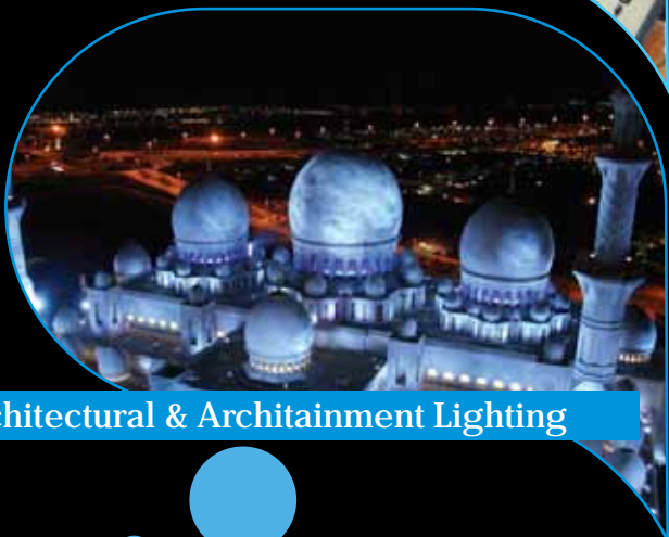
Architectural & Architainment Lighting